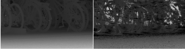
Figure 4. Disney implementation v. our implementation