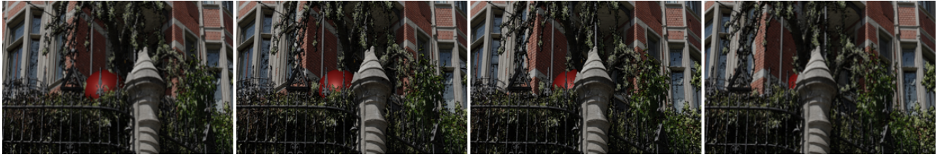
Figure 5. Disney stack, post compositing