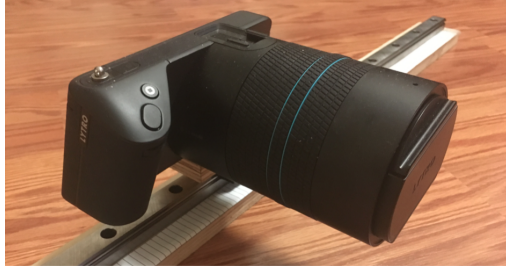
Figure 2. Camera Track with Lytro Camera