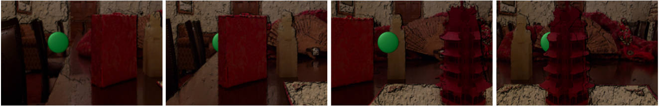
Figure 6. Lytro stack, post compositing

rithms to work better at higher spatial resolutions and with more perspectives on the same scene, both of which would be offered by a larger camera.